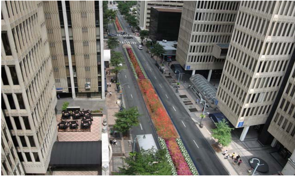
Aerial view of proposed median on Peachtree Street between Pine Street and Forsyth